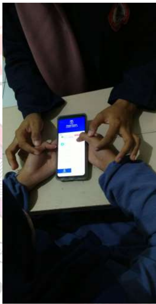
Figure 4.5 Menu grammar, tenses.