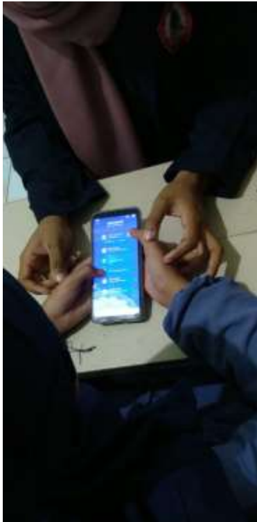
Figure 4.3 : Explanation of the contents of the application menu.

Figure 4.2 Showed that the teacher asks students to prepare cellphones and after that students must download the application from Playstore or can transfer to each other via a Bluetooth device, after that each student must open the application on the main menu display or the main logo of the English Grammar Learn & Test application.