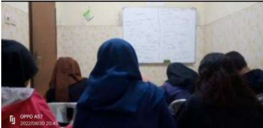
Figure 4.1: Explanation of the application and Simple Present Tense.

The second part is the part when the teacher begins to explain about the introduction of this application by using simple present tense grammar teaching. Students then pay close attention to the teacher's explanation.