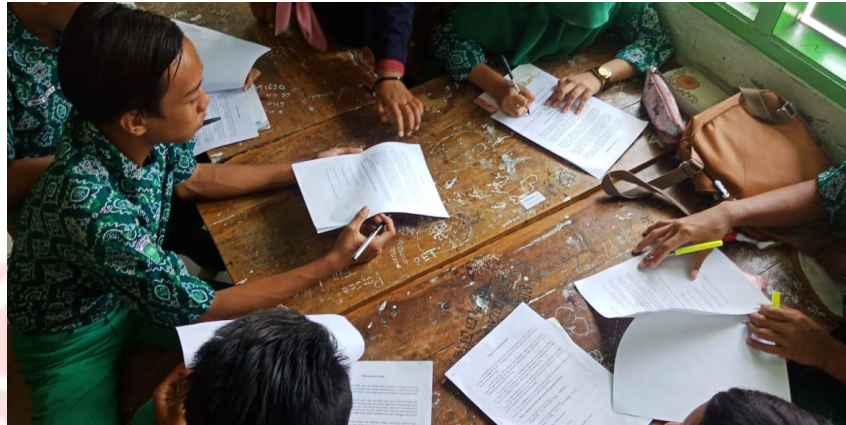
Picture 4.1.5 The students make a group expert

Before forming groups, the teacher has choose the active students and passive students in ne group in order to facilitate the students in learning English. The teacher gave a different text recount to each group. The teacher appointed one smart student as a leader in a group to help other students. The teacher also asked students to read and analyze the recount text. The students discussion with members of their group to learn and understand the text provided by English teacher. The teacher gave 20 minutes to analyze the recount text. The teacher also monitored the students and helped students who had difficulty in discussing the recount text.