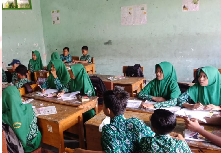
Picture 4.1.2 The students make a group heterogeneous

Before the teacher started the lesson about the recount text, the teacher asked the students to form groups. The teacher told students to count from one to six. In this case, the teacher instructed students to say the same number. After forming the groups, the teacher began the material of recount text.