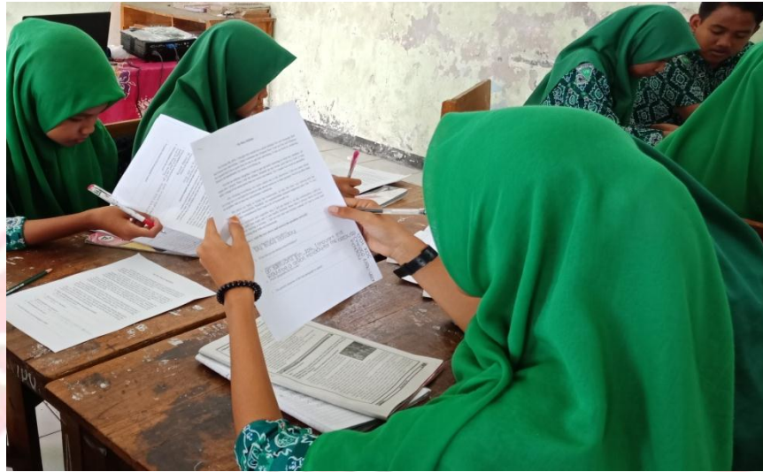
Picture 4.1.6 The students reading test about recount text

The teacher would take a reading test. The teacher asked one student to read the text which been given to the students at the last meeting and to explain about the text recount which been discussed in the group members. While other group were asked to work on the essay questions that which given. The researcher also gave a questionnaire to the students, to find out the students' perceptions of the jigsaw technique taught in reading the recount text. While waiting for their turn, the students learn to read to their friends in one group.