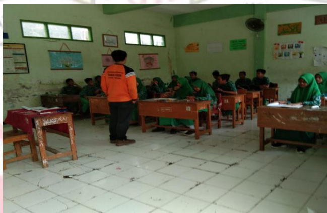
Picture 4.1.1 The teacher greeting for the students before teaching learning process

Before the students were taught about recount text using jigsaw technique, the students were given some of Ice breaking. It was the English lesson in the last period. The teacher used Ice Breaking of “Teko kecil”. The students felt very excited towards ice breaking. The students ready for the learning activity process. After that the teacher distributed sweets to the students to make them not get sleepy during the lesson.