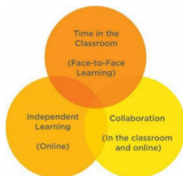
Figure 1. Blended Learning Concept