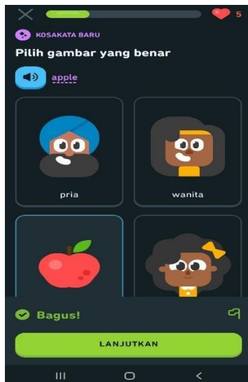
Figure 1: Picture guessing exercise