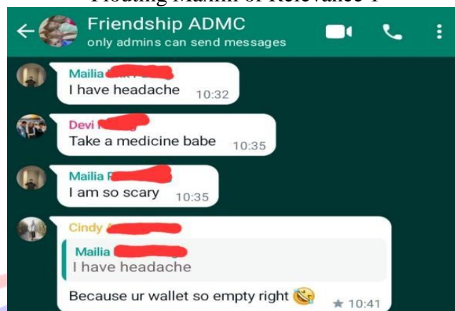
Figure 3.2 WhatsApp Group Chat: Flouting Maxim of Relevance 1