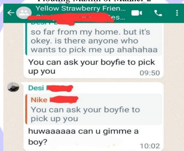
Figure 3.6 WhatsApp Group Chat: Flouting Maxim of Manner 2