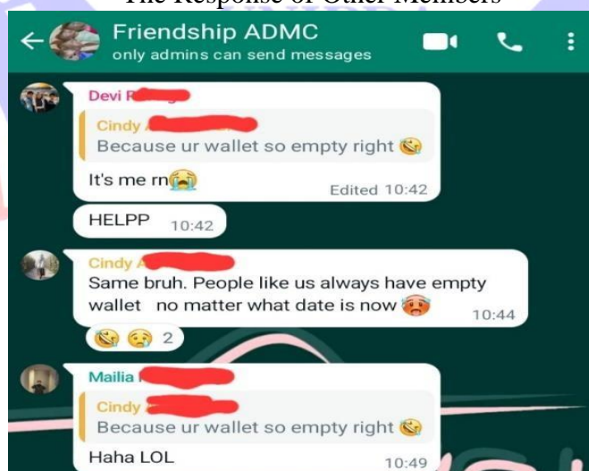
Figure 3.3 WhatsApp Group Chat: The Response of Other Members

When Cindy flouted the maxim of relevance, she aimed to create a different atmosphere. This goal was to create a humor by deliberately changing the topic of conversation. This can be seen from the reactions of other members after Cindy created a joke in conversation. There were the next reactions of other members: