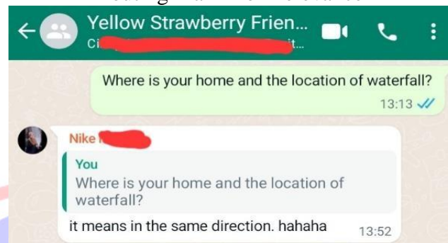
Figure 3.4 WhatsApp Group Chat: Flouting Maxim of Relevance 2